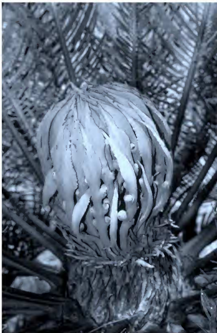
Fig. 4. Cycas cupida female plant with megasporophylls.

is estimated that the area of suitable habitat comprises less than 60 km 2 and although diffuse, there is only one large population of this cycad. Blue-leaved cycads are desirable to cycad collectors (cf. Forster 1999) and it is likely that interest in C. cupida will be intense.